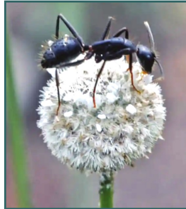
Above: ant pollinating a pipewort flower in Brazil while snacking on pollen