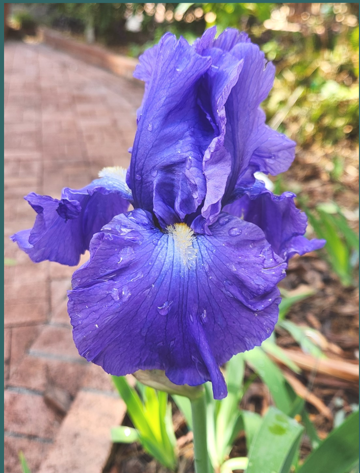
Blooming at TBG on 10 Feb 2024 Clockwise from top left: 'I'm Back,' 'Old Blue Eyes,' a bed of tulips, and 'Peggy Sue' - SC